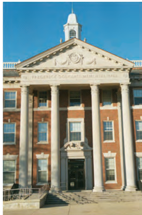
Photo 5-3: View of Douglass Hall