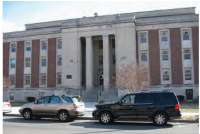
Photo 5-11: View of Division of Allied Health Sciences and Nursing