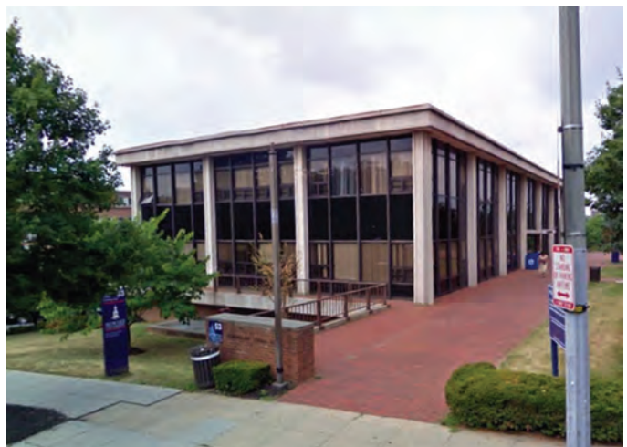
Photo 5-6: View of Inabel Burns Lindsay Hall/School of Social Work